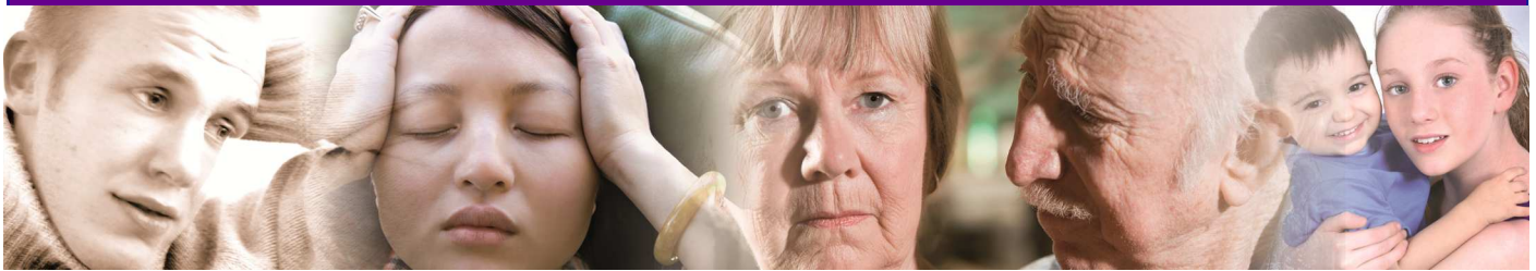
Supporting Carers: The Case for Change