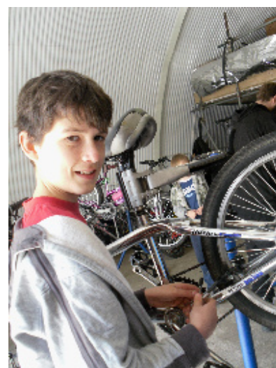
Young Carers getting to grips with bike maintenance